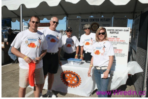
SCRC volunteers selling raffle tickets at the Wine Fest.